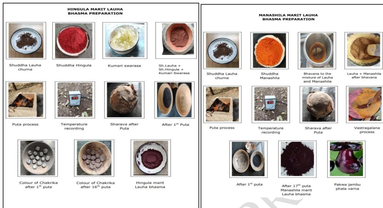
Fig. 1: Hingula Marit Lauha Bhasma Preparation

d. Puta Procedure: Puta procedure was carried out.